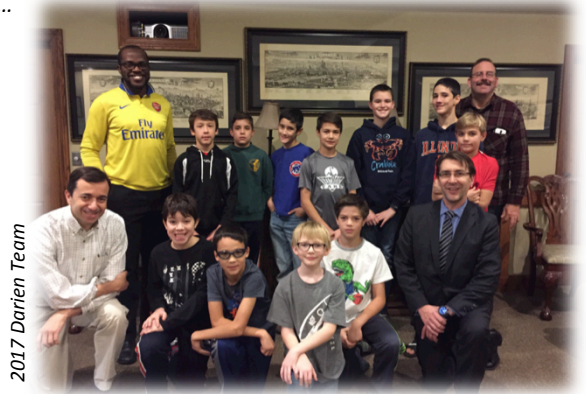
2017 Darien Team

INTO ORBIT CHALLENGE Join our mission into the 30th season of FIRST®! Prepare for blast off, break out of your earthly constraints and go INTO ORBITS™. The 2018/2019 FIRST® LEGO® League season will transport your team into space, where you'll explore, challenge, and innovate in the vast expanse of space. www.firstinspires.org